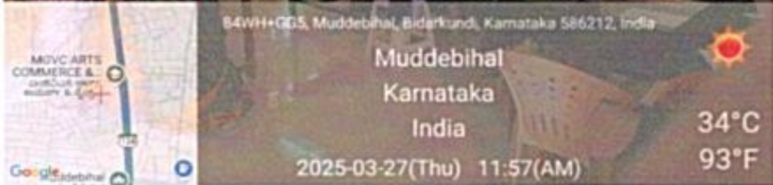
Participation of Staff and Students in the Programme